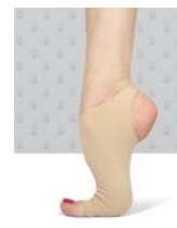
option for contemp...

* knee pads a good idea and recommended ** No baggy tops or shorts. No dancing in socks!