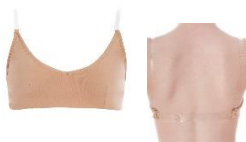
Clear back bra top