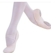
Canvas ballet shoes